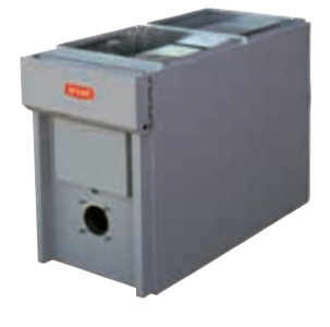
Designed for low ceiling installations.

Versatile, economical oil furnaces for virtually any home.